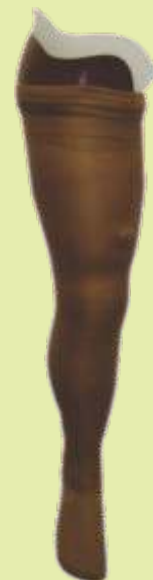
FINISHED TRANSFEMORAL (ABOVE KNEE) PROSTHESIS

Dynamic Ankle (Planter Flexion, Dorsiflexion, Inversion, Eversion, Transverse Rotation), Dynamic Knee (Advanced)